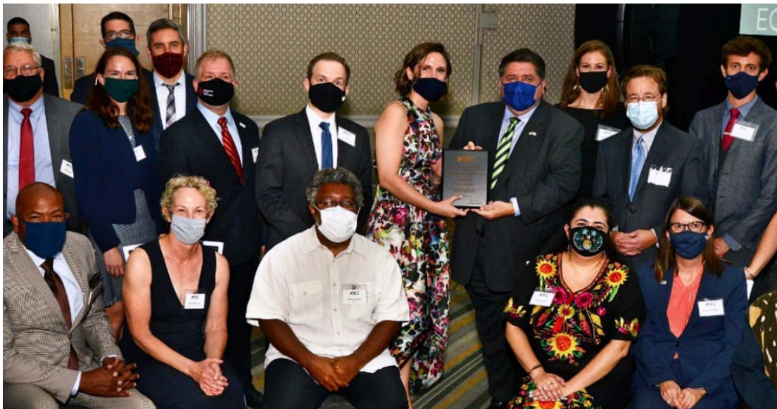
Illinois Governor J.B. Pritzker (center right, with plaque), partners and Vote Solar staff gather to celebrate at the Illinois Environmental Council Gala.

Vote Solar works to develop authentic, respectful partnerships to ensure that the people most impacted by energy decisions have a voice in shaping them. We firmly believe that we are stronger when we work together. Every year, we work with hundreds of partners from diverse constituencies across the nation, including national, regional, state and local community groups. We aspire to grow as an organization in our ability to not only challenge injustice and advance just energy for all, but also contribute meaningfully to the broad movement working to dismantle systems of oppression and build a regenerative future.