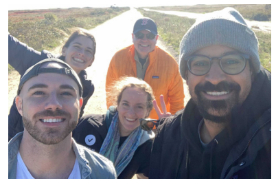
Vote Solar Staff, 2021.