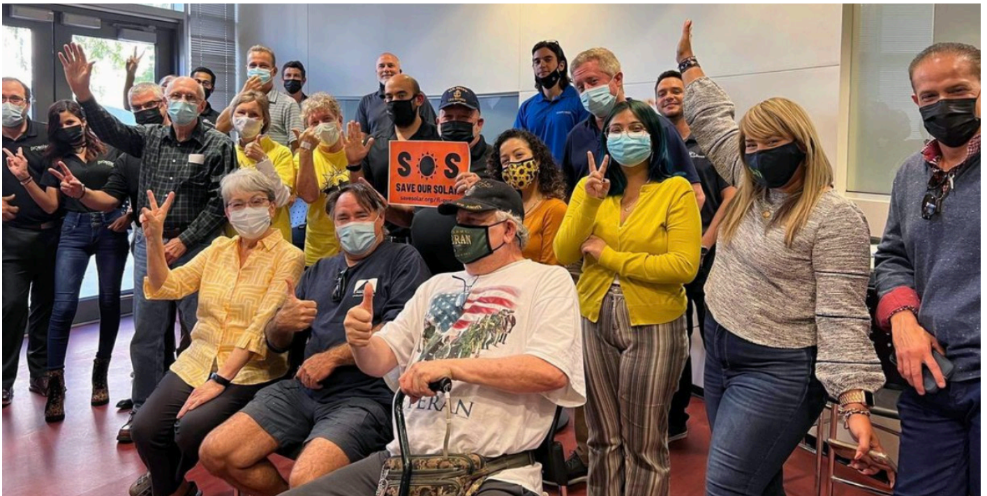
Nearly 70 solar advocates assembled at the Orlando Utilities Commission meeting to support solar net metering in Florida.

under their own control, they are not averse to attacking rooftop solar to limit the choices for the consumer. In 2022, we will rally to defend against Florida Power and Light's (FPL) assault on net metering. We will also work with the utility in implementing the pilot program for resilient schools from last year's