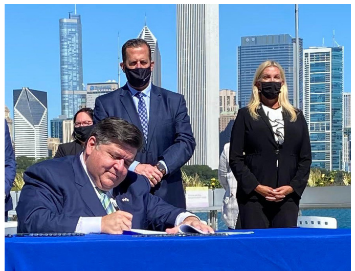
Illinois Governor J.B. Pritzker signs the state's Clean Energy Jobs Act (CEJA) into law.

(DCEO). As part of the implementation process, we will work to develop performance metrics and incentives, integrated grid planning processes, and multi-year rate plans. We will also work to reform the state's Solar for All program to ensure full participation, develop a study of the disparities of rooftop solar in the state, and complete an overhaul of the interconnection standards to accommodate the next generation of distributed energy resources, including customer-owned battery storage.