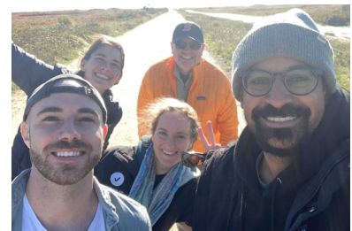
Vote Solar Staff, 2021.