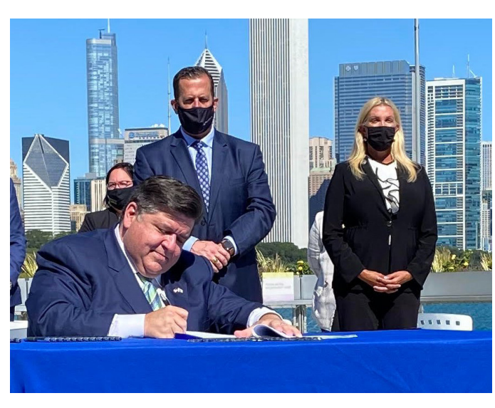
Illinois Governor J.B. Pritzker signs the state's Clean Energy Jobs Act (CEJA) into law.

(DCEO). As part of the implementation process, we will work to develop performance metrics and incentives, integrated grid planning processes, and multi-year rate plans. We will also work to reform the state's Solar for All program to ensure full participation, develop a study of the disparities of rooftop solar in the state, and complete an overhaul of the interconnection standards to accommodate the next generation of distributed energy resources, including customer-owned battery storage.