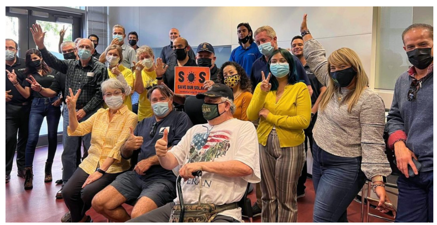
Nearly 70 solar advocates assembled at the Orlando Utilities Commission meeting to support solar net metering in Florida.

under their own control, they are not averse to attacking rooftop solar to limit the choices for the consumer. In 2022, we will rally to defend against Florida Power and Light's (FPL) assault on net metering. We will also work with the utility in implementing the pilot program for resilient schools from last year's